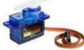
Fig 3: Servo Motor

Servo Motors: Aptech deals with SG90 micro servo motor 9g rc robot helicopter airplane boat controls (1pc) – get this micro servo motor 9g rc robot helicopter airplane boat controls. Operating speed: 0.12second/60degree ( 4.8v no load). Stall torque (4.8v): 17.5oz /in (1kg/cm) .