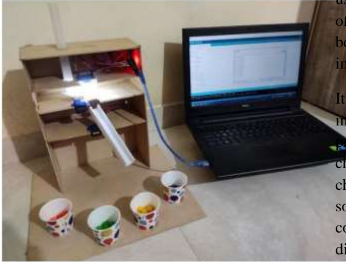
Fig 9: Final System

This system is able to recognize four different types of colored skittles using RGB values of the skittles in order to sort them based on the respective color. It takes 1.5 seconds time to sort one skittle which is less than the manual sorting. With this automatic sorting machine we can save time and labor cost very effectively. Though this system has some limitations, by having done some modification this concept can be implemented in a wide range of applications such as in Fruit Industries.