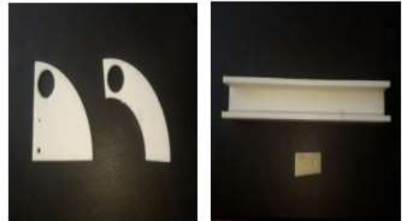
Fig 8: 3D Printed Parts

D6 digital pin of Arduino. The red lines show the voltage supply in the whole circuit. At the end it is connected to the power on/off switch to keep the circuit in working mode or in sleep mode.