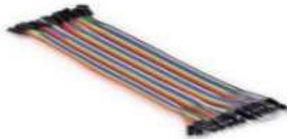
Fig 4: Jump Wires

Jump Wires: Length: 200mm, Weight: 25 gm. 1p-1p pinheader, Male to Female, A row of 40 root Compatible with 2.54 mm spacing pin headers, 40pcs chromatic male to female color jump wire.