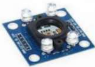
Fig 2: Color Sensor

Colour Sensor : TCS3200 color sensor gy-31 TCS230 module for Arduino, arm and other MCU high-resolution conversion of light intensity to frequency programmable color and full-scale output frequency power down feature communicates directly to microcontroller s0~s1: Output frequency scaling selection inputs s2~s3: Photodiode type selection inputs out pin: Output Table frequency1 supply voltages up to 5v. : Input voltage: (2.7V to 5.5V) Working temperature: -40 deg C to 85 deg C Size: 28.4 x 28.4 mm (1.12x1.12") Programmable color and full-scale output frequency .