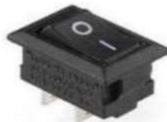
Fig -5: Switch

Switch : Rating: AC 250V/16A 125V/20A, Contact Type: DPDT,On/Off/On; Pins:6, size : 31 x 25 x 29 (L X B X H) mm,Material: Plastic, Metal; Package Content: 2pcs x 3 way Rocker Switch.