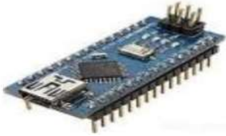
Fig 1: Arduino NANO

Colour Sensor : TCS3200 color sensor gy-31 TCS230 module for Arduino, arm and other MCU high-resolution conversion of light intensity to frequency programmable color and full-scale output frequency power down feature communicates directly to microcontroller s0~s1: Output frequency scaling selection inputs s2~s3: Photodiode type selection inputs out pin: Output Table frequency1 supply voltages up to 5v. : Input voltage: (2.7V to 5.5V) Working temperature: -40 deg C to 85 deg C Size: 28.4 x 28.4 mm (1.12x1.12") Programmable color and full-scale output frequency .