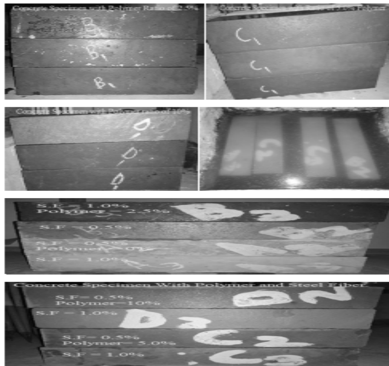
Figure 3 Beam specimen