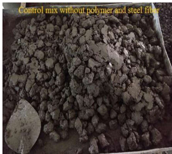
Figure 1 mixer of with and without polymer with steel fiber

The specimen of concrete which was in the size of 250 mm x 250 mm x250 mm and pillar estimate is 200 mm x 200 mm x 500 mm is set up for various extent of concrete material. Are appeared in Figures 1, and 2 ,3. The impact of the synthesis of the completed 3D square surface and the impact of the concrete example's quality made by the diverse blend proportion is to see.